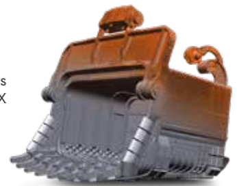
A parametric solid models created in Geomagic Design X

If you can design in CAD, you can start using Geomagic Design X right away. It's fully-renewed user interface and workflow tools make it easier than ever before to quickly and accurately create as-designed and as-built 3D CAD and model data.